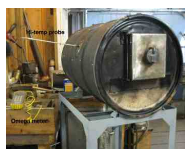
(showing temp meter & probe)

The forge is a typical 55 gallon drum. A pair of 90 degree 3" pipe couplings were welded over 2.5" holes at the upper rear to provide vents. The door is a stainless steel shell (approximately 6" x 7" internally) insulated with 2300 F kaolwool. The door sockets over an angle iron "mouth" on the forge, is hinged on the left with a slotted hinge system that allows the door to swing free, and is equipped with a "glory hole" to allow observation into the forge. The forge is insulated with 1.5" thick kaolwool that was treated with "Instuf" from Ellis Forge. There is a stainless bar running the length of the forge that is suspended 3" from the top center of the forge. Hooks will be used on the bar to suspend blades near the center of the forge. There is a probe port on the right side of the unit. The probe is a high-temp Type K probe that talks to a digital temperature meter (both from Omega). There is a 1.25" diameter stainless steel burner port at the center bottom. The port is equipped with a 3/8x16 nut welded to the side and a bolt that passes through the nut and into the lumen of the port. A venturi burner with a 0.040" orifice (2.5" bell & a 3/4" black pipe tube (~1.1" diameter)) is inserted into the burner port and is locked in place with the bolt. A refractory brick with a 1.25" hole is placed over the burner tip and a stainless steel diffuser sits just above the burner opening.