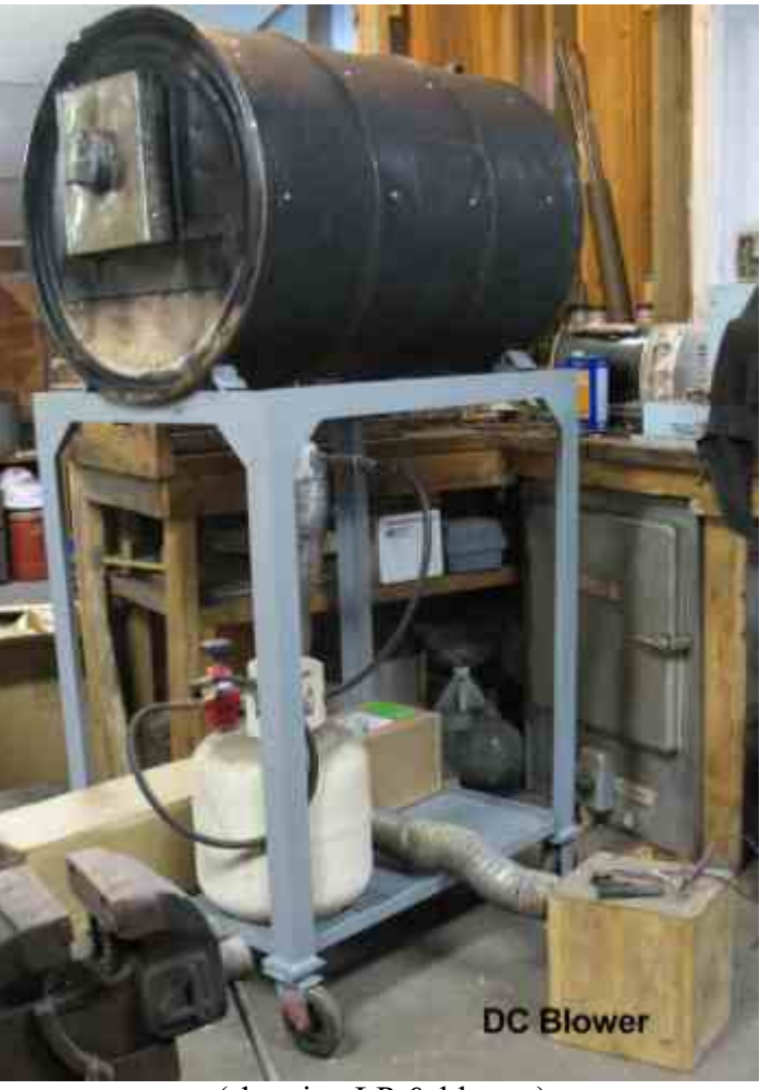
(showing LP & blower)

It turned out that with the door closed and the burner at minimum pressure, the burner would flame out. To counter that, I applied a very gentle breeze from a 12V DC blower running on a hair above the current needed to keep the squirrel cage spinning. The next step was to determine if the unit could maintain 1550 F. As you